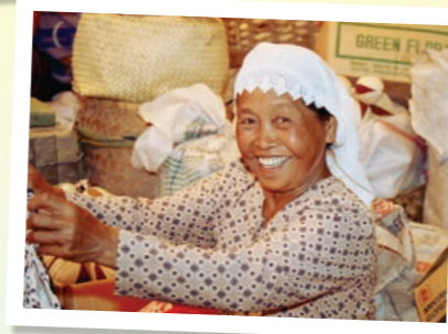
All photographs* used in this publication are copyright © to UNESCO (*except UQ students opposite).